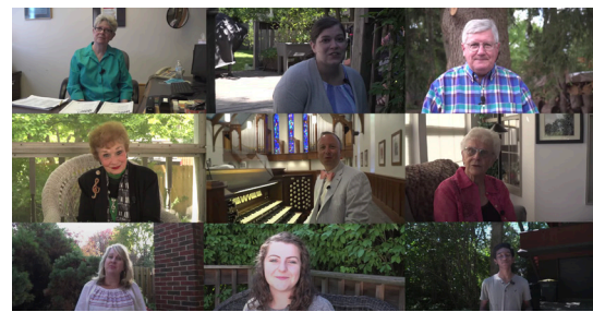
A virtual invitation to our "No-Show" Gala this fall — we would have loved to gather in person, but alas, it was not possible.

All videos are available on our website, lafayettemasterchorale.org .