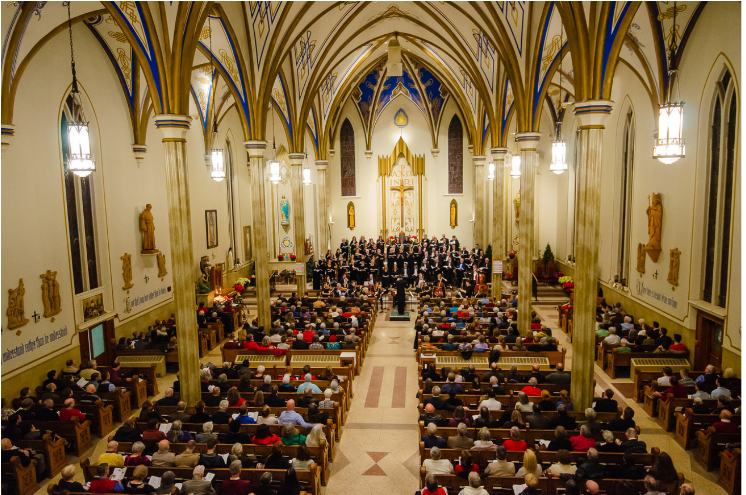
The Lafayette Master Chorale performed Handel's Messiah to a sold-out crowd at St. Boniface Church, Lafayette, on Dec. 21, 2019.

The 55th Season of the Lafayette Master Chorale was, in many ways, an homage to the beginnings of the organization. This year's chorale concerts hearkened back to traditional themes, with a fall performance titled The Best of Bach , and a planned spring performance of Cathedral Classics , which showcased great choral motets and anthems that have rung in glorious cathedral around the world, from Tudor anthems to modern hymn settings.